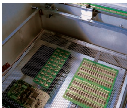
A Glance into the Soldering Zone of the Process Chamber with Work-Piece Carrier and Assemblies

Using vapor as the heat transfer medium the solder product – independent of its size or weight – is homogeneously heated to pre-heat and soldering temperature. Geometric parameters, such as component form, packing density, are unimportant for the heating process. Due to the high density of the vapor the oxygen is displaced from the heating and soldering area. Consequently, no protective gases are necessary.