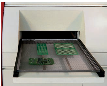
In-feed with work-piece carrier and a variety of assemblies

The modern design of the machines and the physical laws of the process permit to defect-free soldering of the most complicated SMT assemblies even with lead-free solder pastes. Components such as QFPs, BGAs, Flip-Chips as well hybrid assemblies may be processed with high quality results.