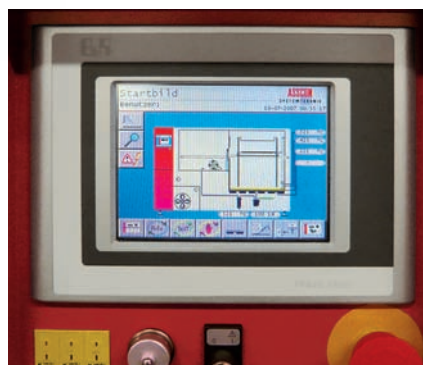
Operational Panel (Colour-Touch-Screen)

The machine's controller unit is located in an integrated control case and comprises switch, control, regulator and safety/fuse elements for all function units. The process is controlled and monitored with a failure message system via microcontroller with colour-touch-screen and intelligent operational panel.